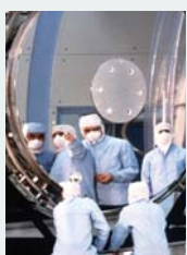
CLEANROOM TECHNICIANS WORKING ON THE HUBBLE'S MAIN MIRROR

If brought into the cleanroom by way of makeup air intakes located on the roof of the facility, these contaminants could have potentially corroded electronic cleanroom instrumentation. The facility's existing High Efficiency Particulate Air (HEPA) filters provided protection against particulates ranging in size from 0.003-100 microns, but did not provide protection against the chemical contaminants of concern, ranging in size from 0.0003-0.0007 microns.