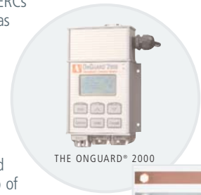
THE ONGUARD® 2000

Ultimately, the roofing project was completed and NASA, with the help of Purafil, maintained the cleanroom's air quality to above acceptable levels for the duration of the project.