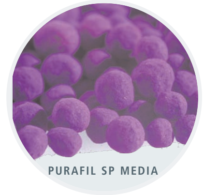
PURAFIL SP MEDIA

PURAFIL SP MEDIA demonstrate a higher working capacity for broad-spectrum oxidation of contaminants in actual field condition, where multiple gas challenges are present. The Purafil SP Series has been specially engineered to contain more permanganate (the active ingredient) for increased removal capacity, allowing the media to remain more available for removal of target gases.