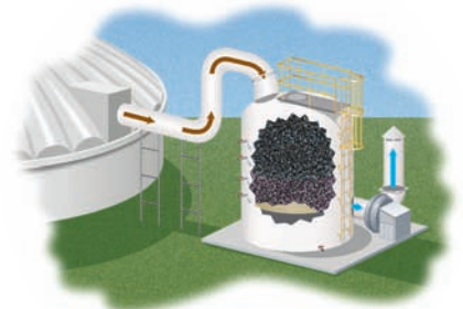
THE PURAFIL ESD VESSEL SCRUBBER

THE PURAFIL ESD VESSEL SCRUBBER (VS) removes high concentrations of odorous gases from large headworks, full treatment plants and large digesters. The VS is sized for airflows from 8,000 to 20,000 cfm and is available in single or dual media bed designs. In single bed designs, odors are drawn into the inlet plenum and through the media bed where contaminants are chemically removed. Dual bed scrubbers feature a split media bed, ideal for higher airflow applications. Treated air is discharged to the atmosphere through vertical stacks. Both designs offer 100% gas removal efficiency and ensure a partial vacuum throughout the treatment area.