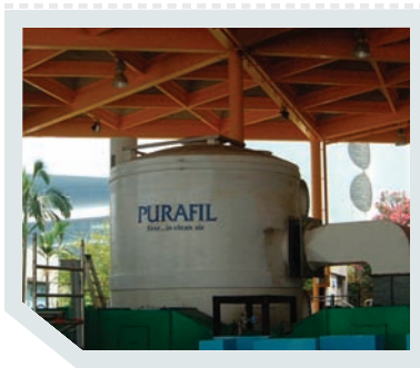
PURAFIL ESD VESSEL SCRUBBER