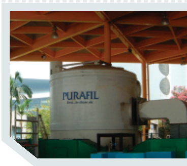
PURAFIL ESD VESSEL SCRUBBER