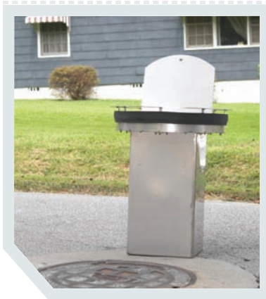
PURAFIL ESD MOLE MANHOLE SCRUBBER

THE PURAFIL ESD MOLE™ MANHOLE SCRUBBER effectively removes odors emanating from street-level sewer manholes. The collar of the scrubber rests just below the manhole cover. Odors enter the MOLE™ through the bottom of the unit and flow upwards through two passes of Odormix™ SP (patent-pending) media, where they are absorbed and chemically converted to non-organic salts.