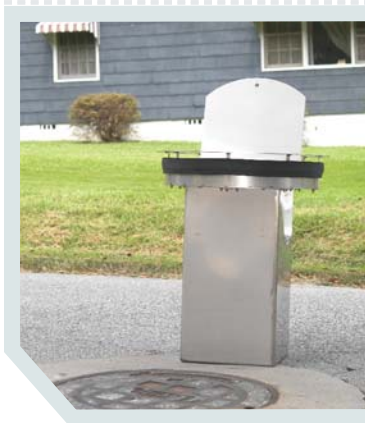
PURAFIL ESD MOLE MANHOLE SCRUBBER