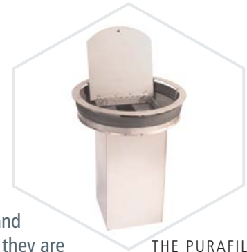
THE PURAFIL ESD MOLE™ MANHOLE SCRUBBER

THE PURAFIL ESD MOLE™ MANHOLE SCRUBBER effectively removes odors emanating from street-level sewer manholes. The collar of the scrubber rests just below the manhole cover. Odors enter the MOLE™ through the bottom of the unit and flow upwards through two passes of Odormix™ SP (patent-pending) media, where they are absorbed and chemically converted to non-organic salts.