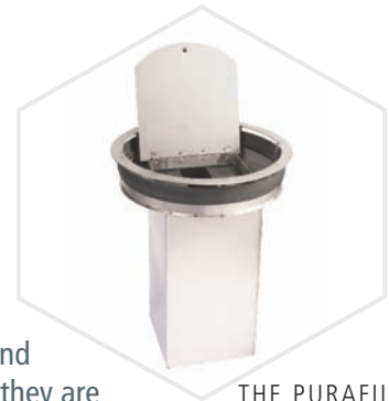
THE PURAFIL ESD MOLE™ MANHOLE SCRUBBER

THE PURAFIL ESD MOLE™ MANHOLE SCRUBBER effectively removes odors emanating from street-level sewer manholes. The collar of the scrubber rests just below the manhole cover. Odors enter the MOLE™ through the bottom of the unit and flow upwards through two passes of Odormix™ SP (patent-pending) media, where they are absorbed and chemically converted to non-organic salts.