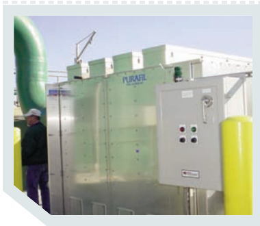
PURAFIL ESD DEEP BED SCRUBBER