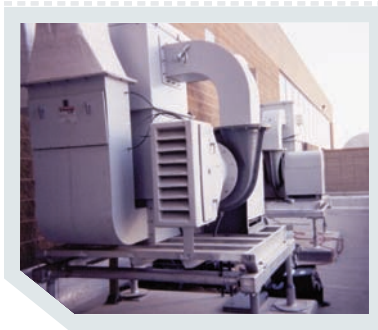
PURAFIL TUB SCRUBBER SYSTEM