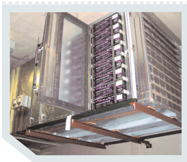
PURAFIL SIDE ACCESS SYSTEM AT THE UNIVERSITY OF GEORGIA JOURNALISM BUILDING, ATHENS, GEORGIA