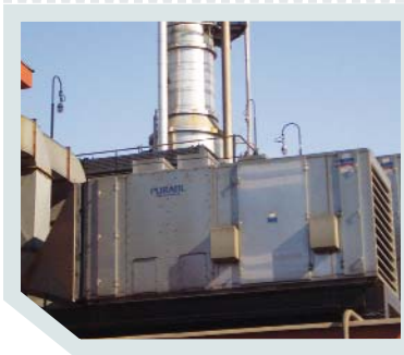
PURAFIL DEEP BED SCRUBBER AT TUPRAS IZMIT REFINERY IN TURKEY