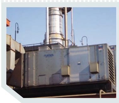
PURAFIL DEEP BED SCRUBBER AT TUPRAS IZMIT REFINERY IN TURKEY